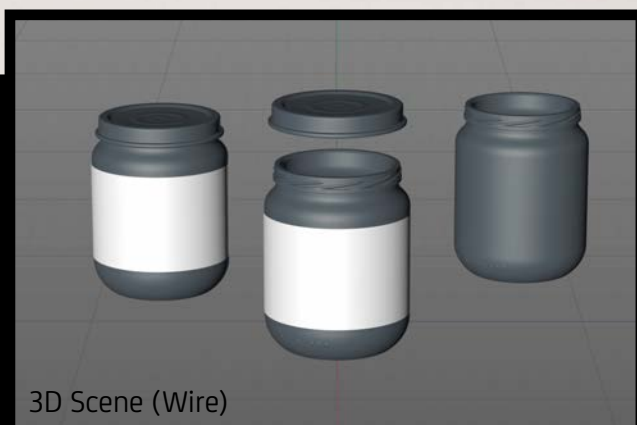
3D Scene (Wire)