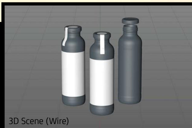
3D Scene (Wire)