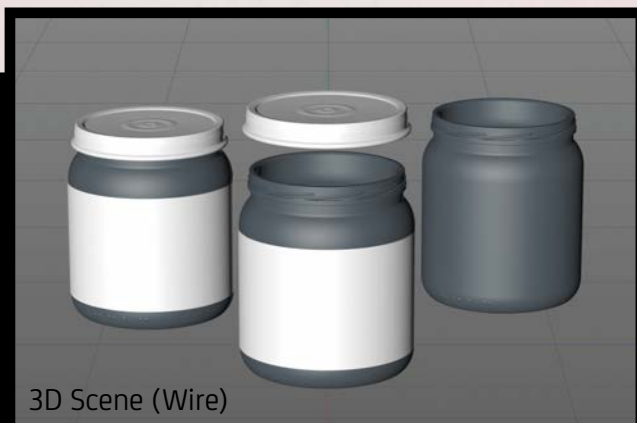
3D Scene (Wire)